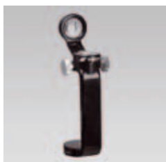
Fundus Viewer FV-IL