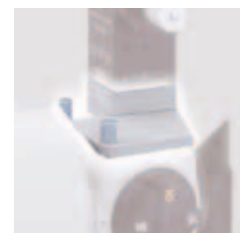
Tonometer Mount for R870 (SO-TM2)