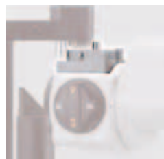
Tonometer Mount for R900 (SO-TM1)