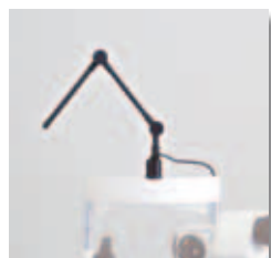
External Fixation Target (SO-FT02)